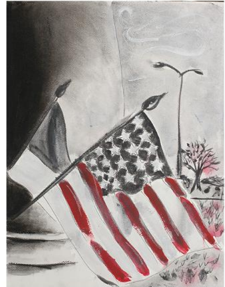
Katrina's Flag Day.

The name 'Katrina' has taken on a metaphorical meaning since late August 2006 when the gusty winds hailing ferocious winds hit the Gulf region of the United States. I have learned that there is power in a name. And 'Katrina' has evolved into meaning so much and so many different ways to so many people.