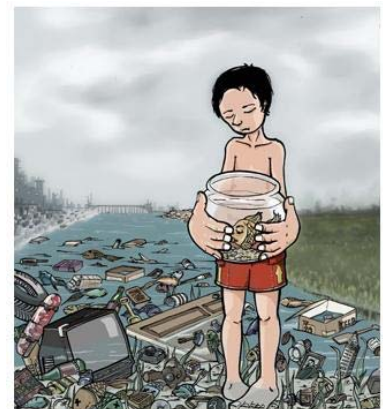
Rivor.

Reveal anything - as long as it is true and you have never shared it with anyone before.